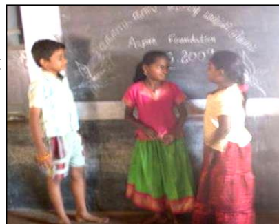
Right - Drama by children on the evils of child marriage