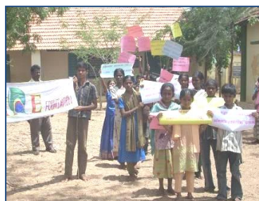
Right - Bicycle rally on the ill-effects of lack of hygiene & sanitation