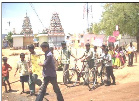
Left - Bicycle Rally protesting against child marriage