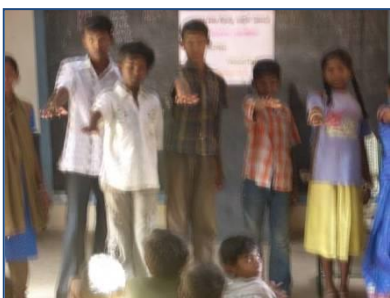
Left - Children taking an oath at the end of the drama on the importance of sanitation

In Thoppupatti village, the Village Learning Centre students conducted a bicycle rally and drama on the importance of personal hygiene and sanitation. Issues such as contamination and diseases that arise due to open defecation and spitting in public places were highlighted in the banners and children's slogans in the bicycle rally. The drama portrayed an unhygienic village that understood the problems associated with lack of sanitation and got transformed into a health-sensitized village. Children from 5 villages participated in the rally.