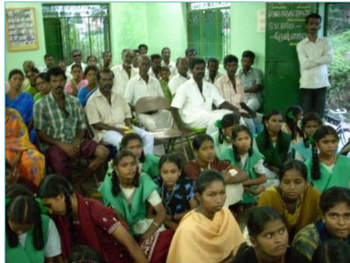
Parents & students getting acquainted with the terms of the scholarship program