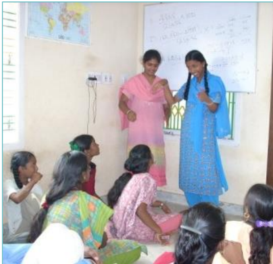
Students animatedly doing role play