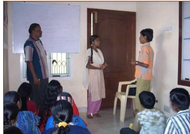
Students engaged in conversation practice