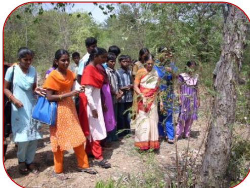
Trichy – herbal plantation