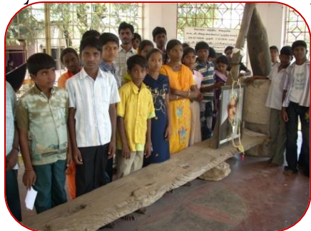
Coimbatore – motor factory