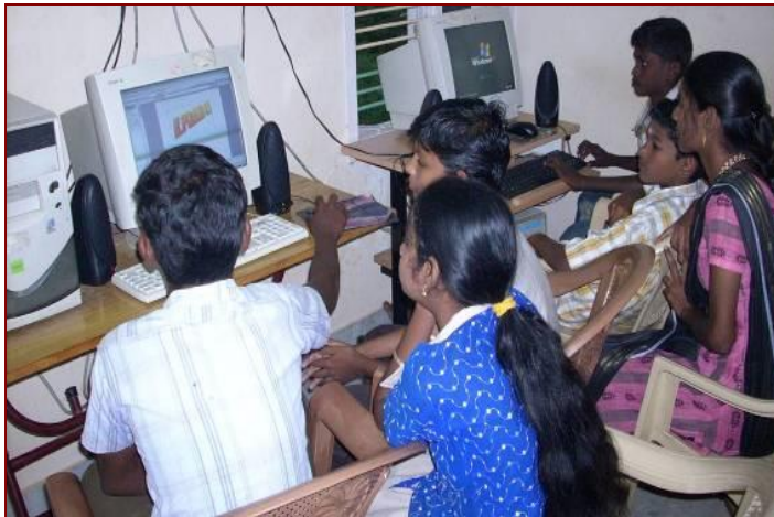
Students engaged in practical use of computers