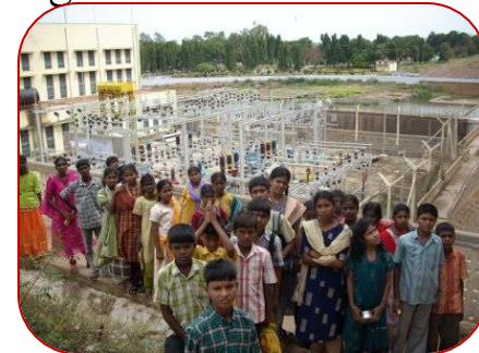
Madurai - Vaigai Dam