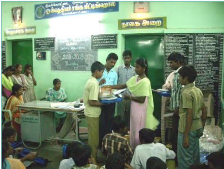
Students being given books, uniforms, bags & stationery at the start of the academic year