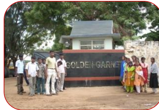
Tuticorin – garnet factory