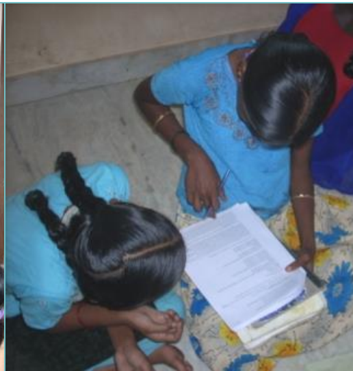
Students discussing a 'logical reasoning' problem in groups