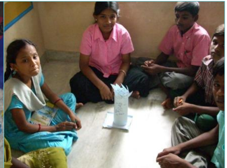
Students involved in a team building activity