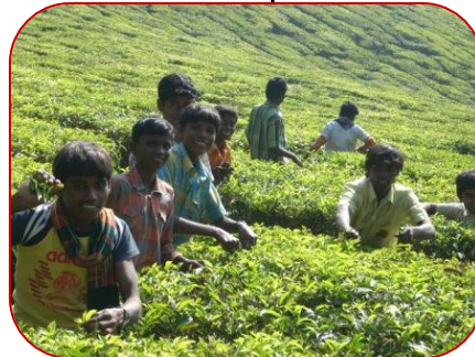
Munnar – tea estate